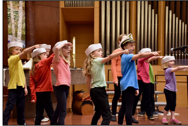
The children of the church perform "Jonah" for their annual musical.