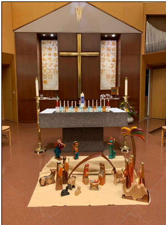
St. Clare's altar set for Epiphany and Feast of Lights.

In the past five years, St. Clare's membership has dropped by 40%. Prior to this time, we boasted over 100 children in our church school and youth groups. Currently we have around 35-40 children. There is a strong