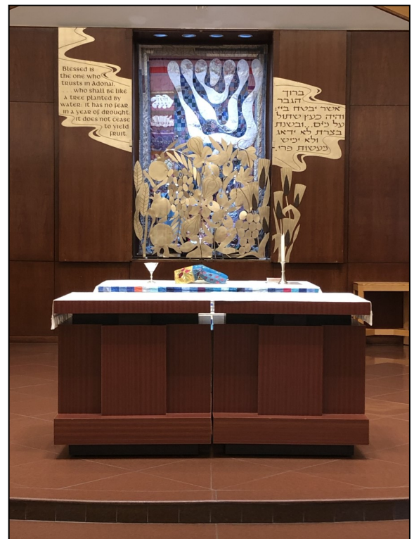
The bema set for Temple Shabbat services.

Balancing the needs of each congregation is a constant challenge. For example, the