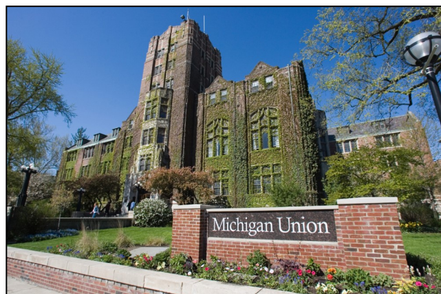
The Michigan Union building on the University of Michigan campus.

St. Clare's is located in Ann Arbor, Michigan, a small midwestern city, with a major research university at its center, both literally and figuratively. The current population is approximately 120,000, with another 30,000 undergraduate students at the University. Ann Arbor combines the social life of a larger city with the community feel of a small town. St. Clare's sits in south-central Ann Arbor, on Packard Street, one and a half miles from Central Campus and two miles from downtown. It is nestled between an