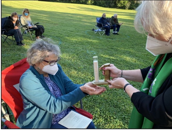
Outdoor eucharist service held during the pandemic.

Clear communication and a willingness to compromise and find creative solutions is the key to an equitable relationship. Our goal is to work cooperatively with TBE on use of the building while not losing sight of our mission and goals. The Genesis relationship is over 45 years old and we have affirmed our commitment to it many times over the years, but this has come about only through hard work, understanding, and flexibility.