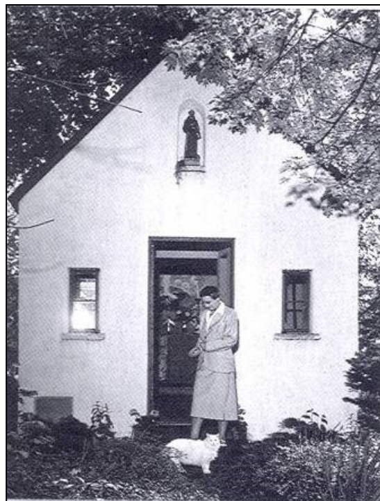
Above: Inez Wisdom in front of the St. Francis Chapel that is still located in front of the current sanctuary.