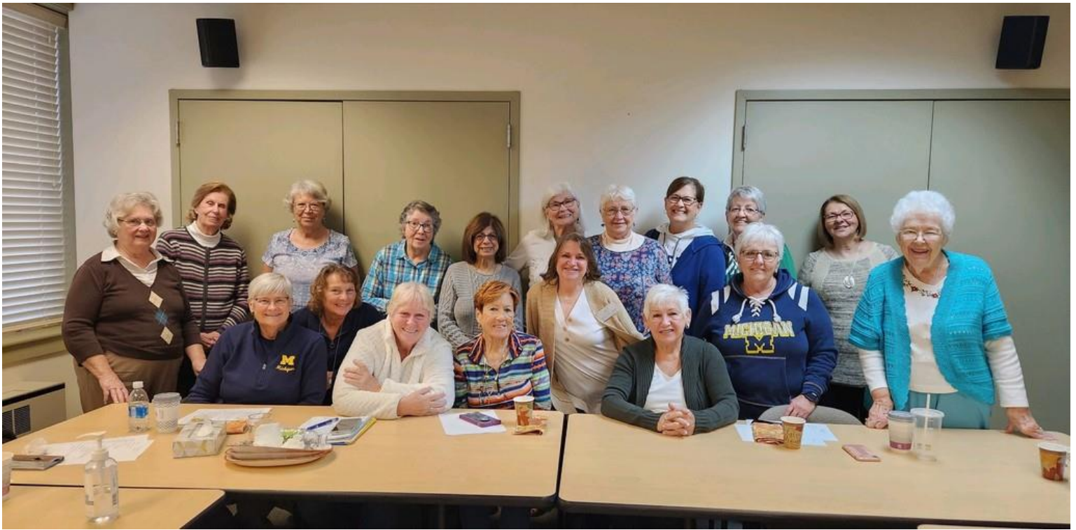
Episcopal Church Women