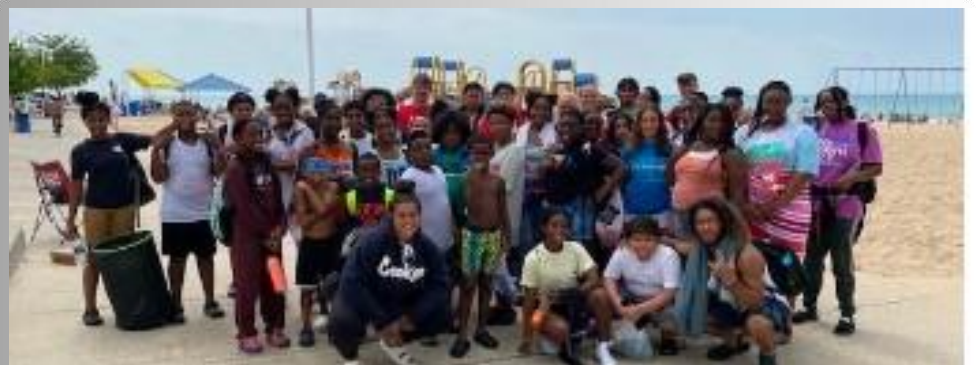
Get REAL Lake Michigan Trip

We are always looking for opportunities in which we can make a positive impact within our community. Teaching our children the importance of giving and ministry is a critical part of our mission.