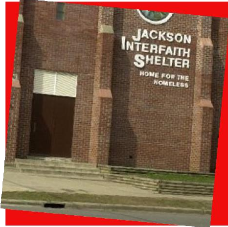
Jackson Interfaith Shelter

By partnering with established non-profit organizations that have existing programs and are doing truly impactful work, we are able to do more than we would if we tried to do it on our own.